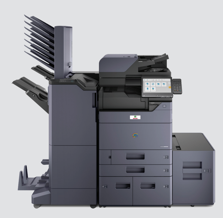
Model equipped with: DP-7160; DF-7140; AK-7110; BF-730; MT-730B); NK-7120; PF-7120; PF-7150