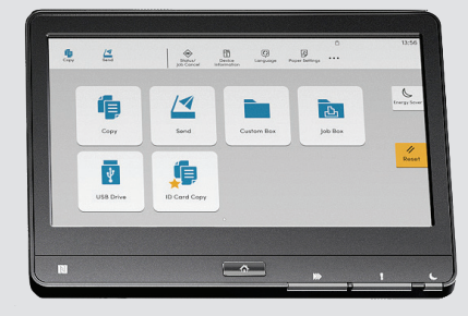
The minimal use of colour on the operation panel makes the icons easier to read, making it easy and intuitive to use, reduces working times and protects the user from possible errors.